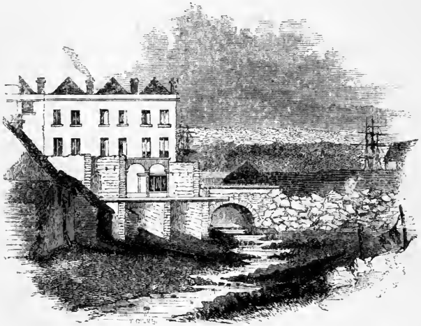
The Tank Stream.

the narrow passage of the lofty heads, kept on widening into a broad sheet of water, indented in every direction with still and sheltered coves, and naturally protected with rocks and woods, which combined a certain air of picturesque romance with indications of safety and fertility. To this port the fleet was immediately removed from Botany Bay, and in the basin of one of its inmost recesses, the ships having come to an anchor, the inmates were landed, and the commencement of the settlement made on the 26th of January, 1788.